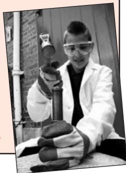
Secondary school pupil enjoying a science session at the Mary Rose