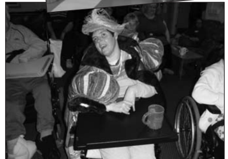
Community Outreach in action