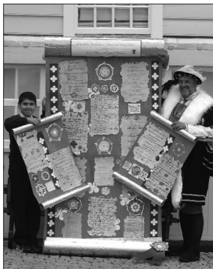
The winning entry from Morelands School, Waterlooville

Schools took part in healthy eating workshops which were delivered in partnership with the Southern Co-operative. Staff from the Co-op brought a selection of food to compare with the diet of the sailors on the Mary Rose. "I wanted to pass on the sincere thanks from all the kids and staff from Corpus Christi School for the amazing workshop that was presented today. They all thoroughly enjoyed the presentation and learnt so much". A competition to design a Tudor banquet menu fit for Henry VIII was won by Morelands Primary School, Waterlooville. The second prize went to St Swithun's School, Southsea