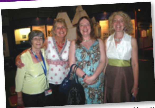
Author Alison Weir, with her fans at the Mary Rose Museum.