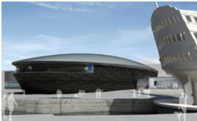
Henry VIII would be proud of his new 'jewellery box' museum.