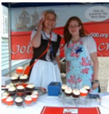
The Mary Rose 500 Appeal sold 500 cupcakes over the Navy Days weekend.