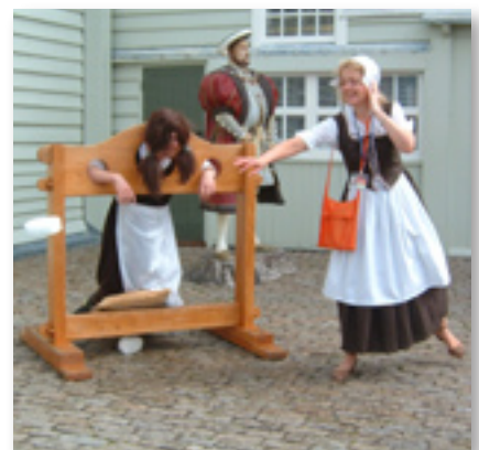
The Drench-a-Wench team got a good sponging in the stocks on the Sunday to raise more money to build the new museum.