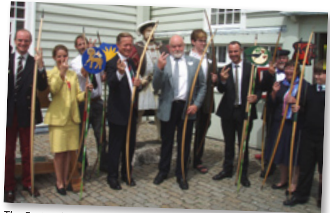
The Fraternity of St George outside the Mary Rose Museum with their traditional salute.

'The Fraternity of Saint George regards it as a matter of respect to raise the symbolic figure of £1545 for the old crew. With the discovery of the Mary Rose, it is as though the chart of our naval and archery history has been given its scale. The sample size of Medieval archers kit found on the Mary Rose is conclusive, it's the very stuff of the Medieval longbowman's legend. The whole of the archery community in the UK should seize the opportunity to be involved with this appeal.'