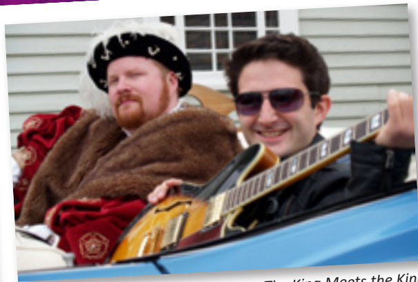
Charity Elvis Rock n Roll Fundraiser - The King Meets the King